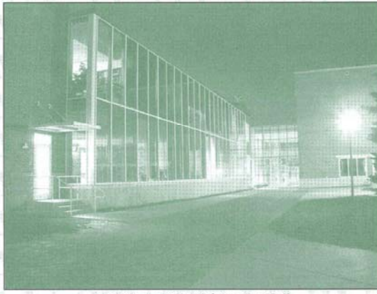
Ophelia Parrish Performance Hall