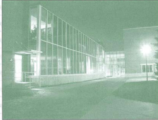
Ophelia Parrish Performance Hall